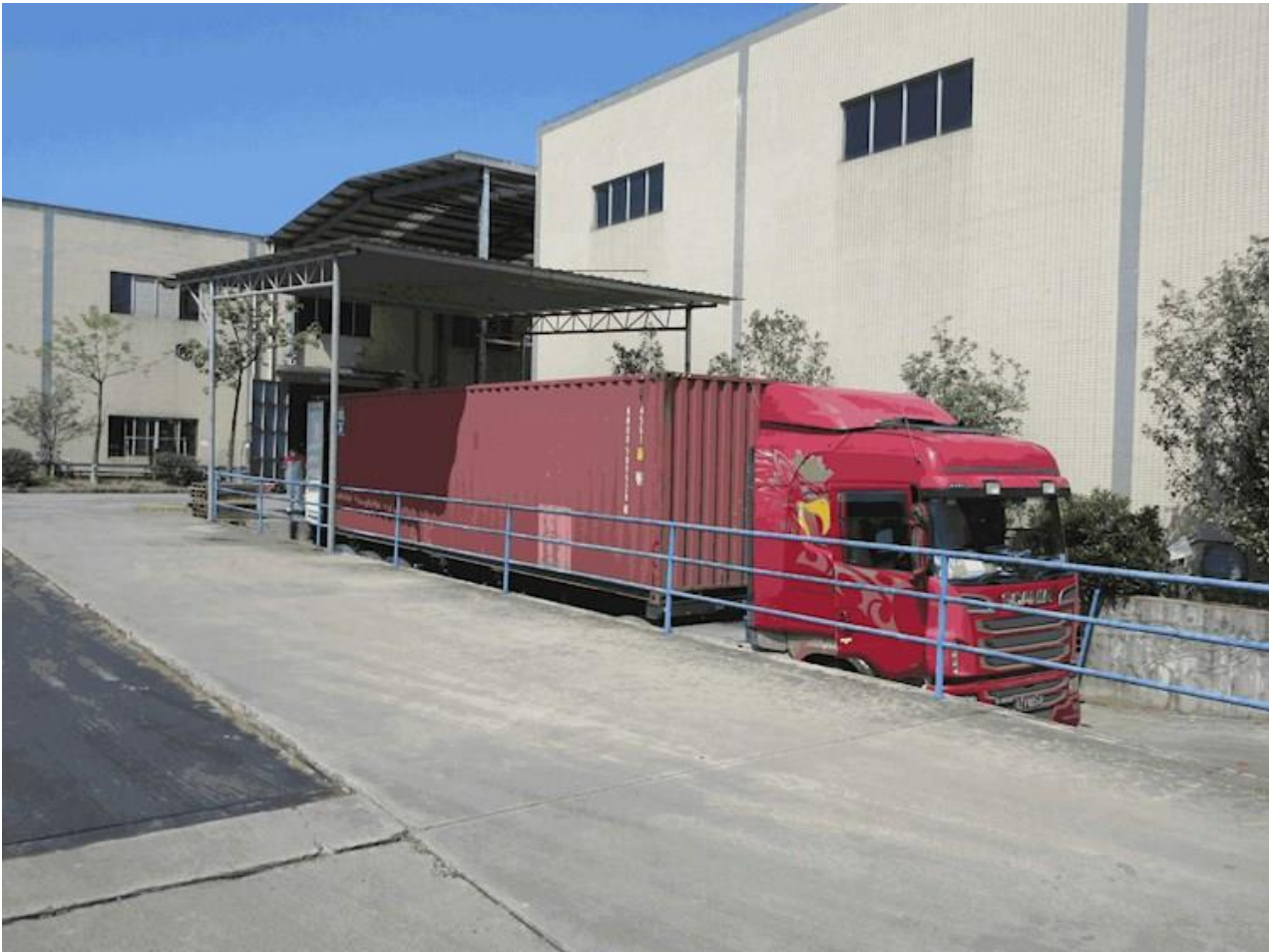
Misc - Question # 127