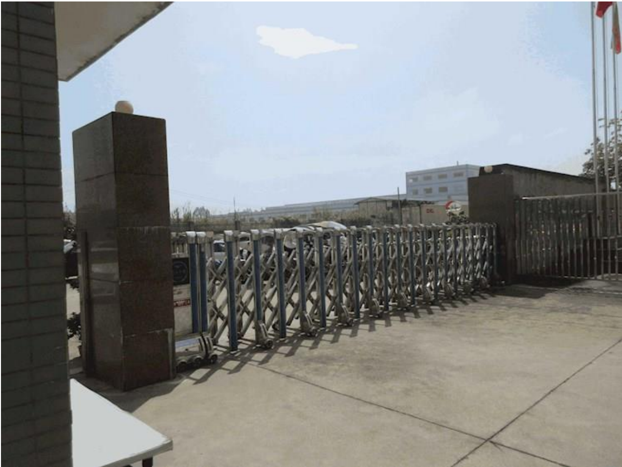
Physical Security - Question # 97