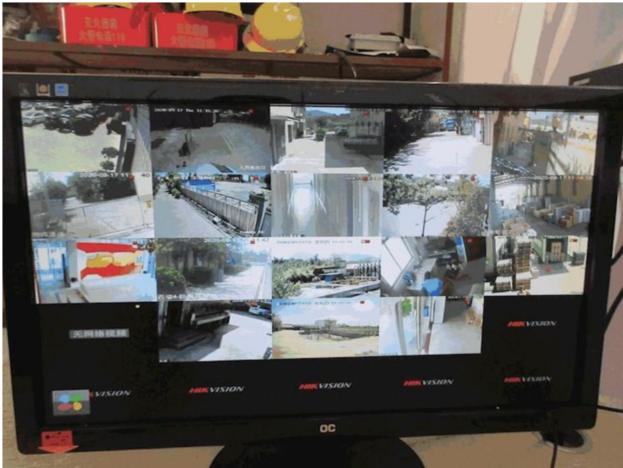
Physical Security - Question # 101