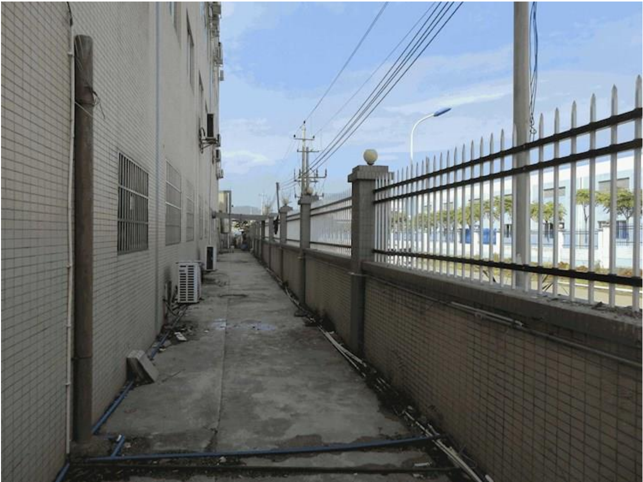
Misc - Question # 128