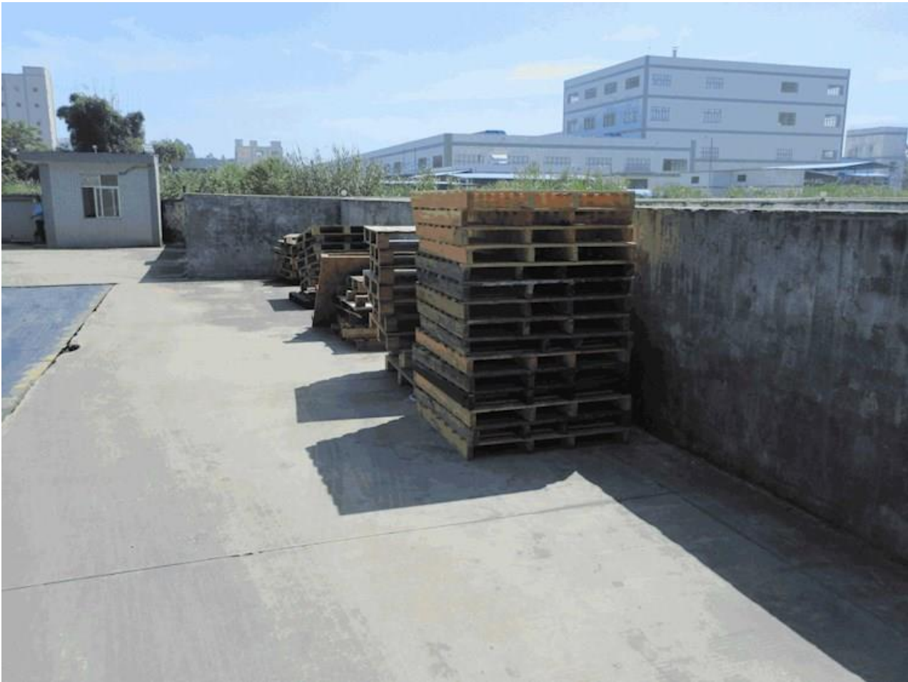
Seal Security - Question # 62