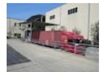
Shipping and receiving area.jpg

Comments: There was a designated shipping and receiving area outside of the production building. This area was monitored by security guard and segregated by physical fences. CCTV cameras, enough lighting, authorized access staff name list and access restriction warning signs are available onsite.