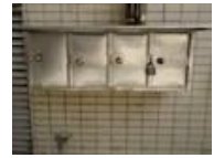
Seals stored in a secured locker.jpg

Additional Comments: No comments were provided