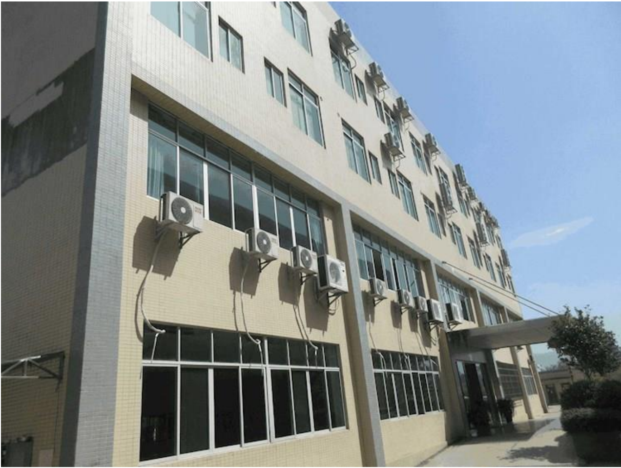
Misc - Question # 126