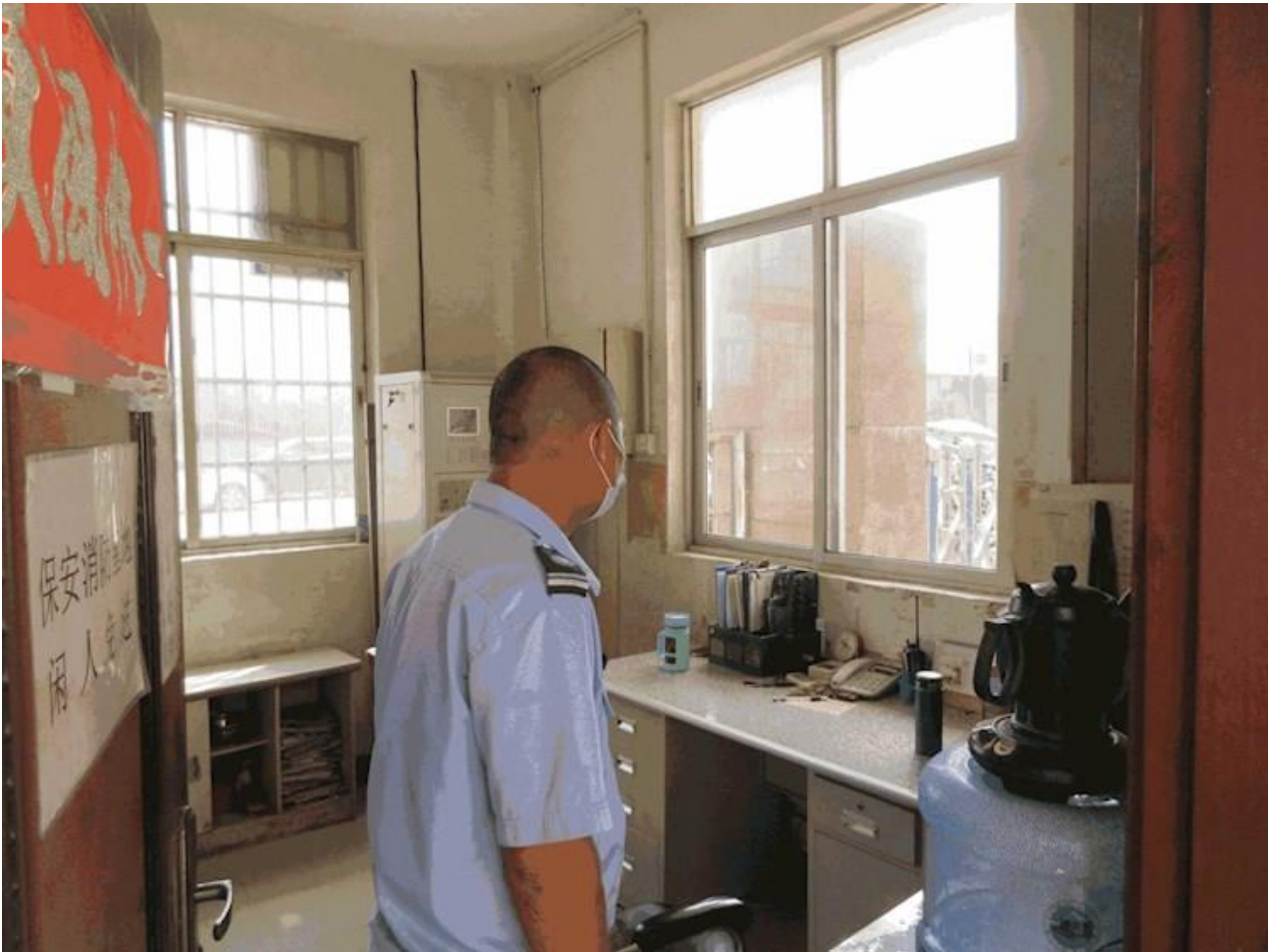
Physical Security - Question # 89