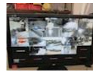
CCTV monitoring system.jpg

Additional Comments: No comments were provided