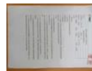
CCTV monitoring procedure.jpg

Additional Comments: Based on the document review and management interview, although there is a CCTV monitoring procedure established in place to require the security officer to conduct