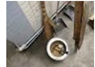
Equipment for container inspection.jpg

Additional Comments: Based on the document review, CCTV records review and management interview, the factory used a hammer for a tap test, a tape measure for distance measuring, a broom which used to sweep or clean the inside of the container to conduct their 7-point container inspection. However, mirrors for the undercarriage of containers were not in use.