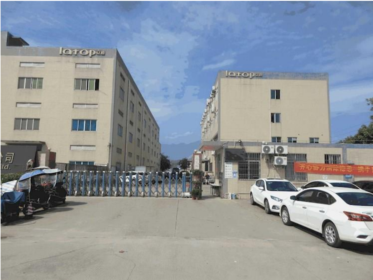
Misc - Question # 125