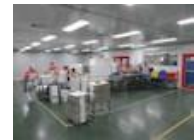
Final packing area.jpg

Comments: There was one final independent packaging area in one 1-story production building with authorized personnel permitted to access only. During the walkthrough, auditor was required to sign the entrance log when access the packing area. And the CCTV system and an employee designated by the facility's management as an observer were in place to monitor the packing area.