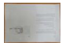
Opening meeting letter.jpg

Additional Comments: No comments were provided