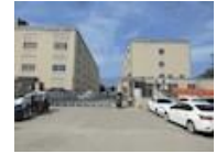
Security guard station and the entrance gate.jpg

Comments: There were two access gates in the factory where the guard stations are located. Security guards are stationed the gates 24 hours/7 days with 2 shifts. CCTV system is installed for monitoring.