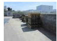
pallets not heat treated and stored outside.jpg

Additional Comments: As per the observation from the factory tour, some pallets are stored outside and on the ground, which are not limit the exposure to seeds, dirt and other forms of contamination. And the wood pallets used in the shipping process were not heat treated or fumigated to kill pests and limit the possible introduction of pests at the loading facility and were not marked with a heat treated stamp or a phytosanitary inspection certificate.