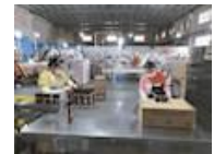
ID badges not displayed.jpg

Additional Comments: There is a procedure to require all employees to display their badge at all times while at the facility. However, as per the observation from the factory tour, 20% of employees in the factory did not wear badges when working.