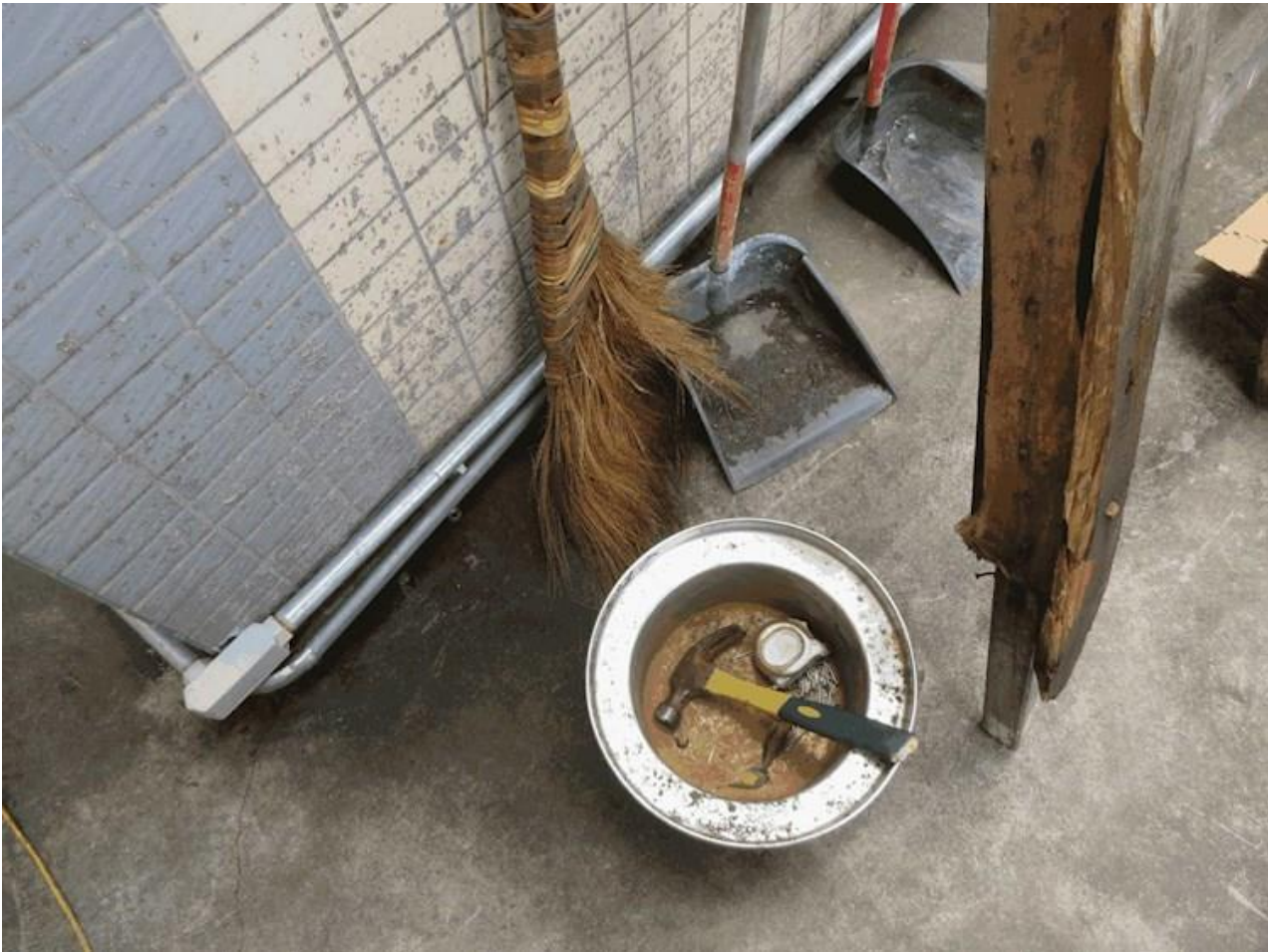
Conveyances and Instruments of International Traffic - Question # 46