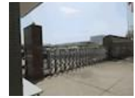
Facility entrance gate.jpg

Additional Comments: No comments were provided