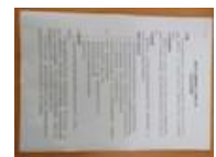
documented crisis plan.jpg

Additional Comments: The crisis plan was established in the facility, however, the crisis plan did not include the following requirements: the potential alternative locations if facility is rendered unusable and the communication to business partners of crisis related issues.