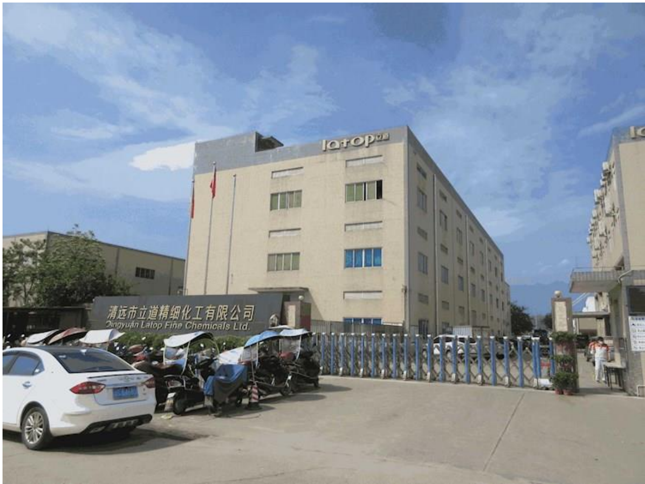
Misc - Question # 124