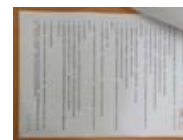
Written procedure for the selection of business partners.jpg

Additional Comments: The written procedure used in the selection of business partners including material suppliers, manufacturers, and logistics service providers was available in the facility, the screening process includes monitoring for financial stability, and the screening process was done on an annual basis. However, the screening process did not include a process of looking for evidence of money laundering and terrorism funding.