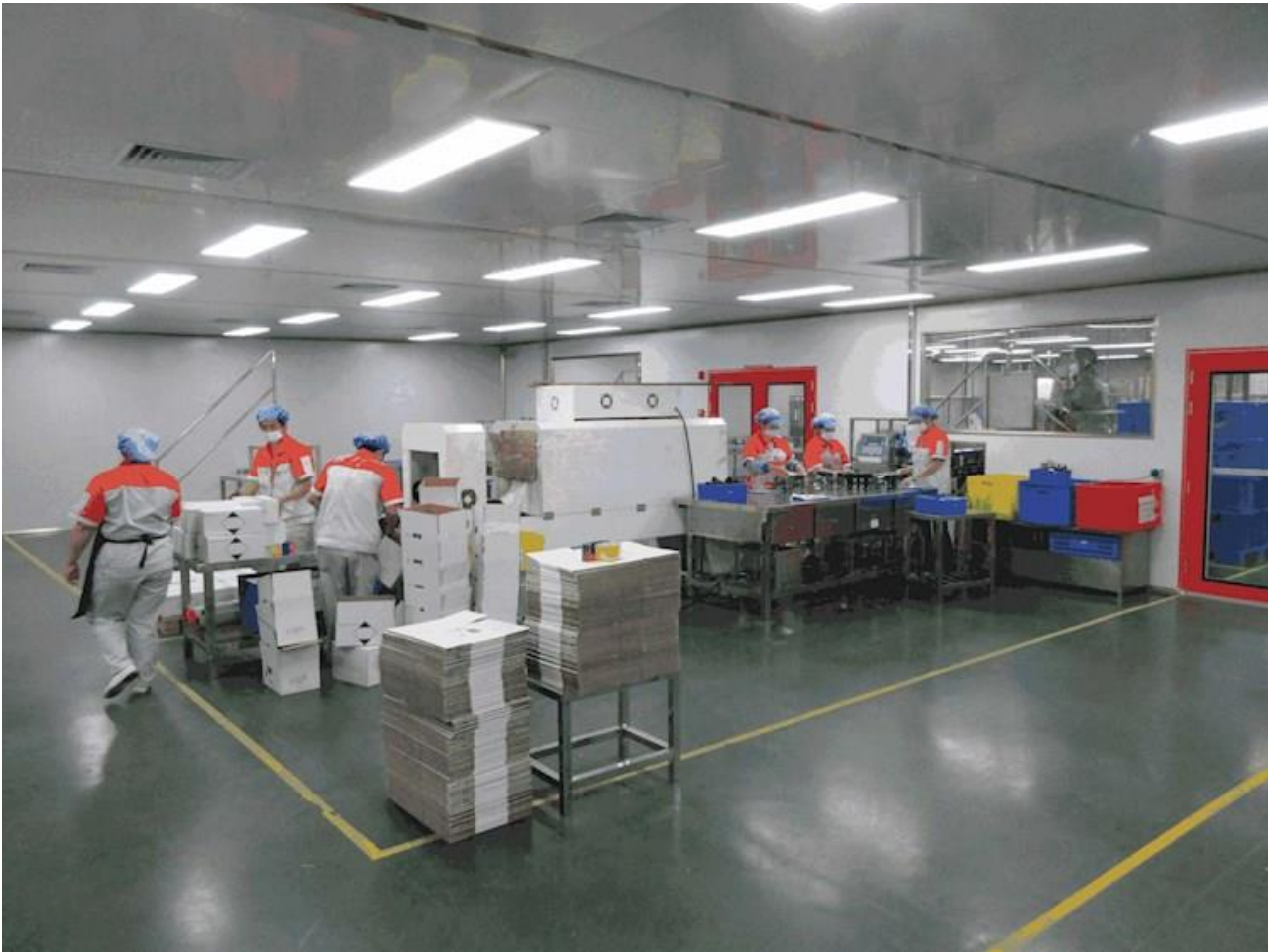
Misc - Question # 130