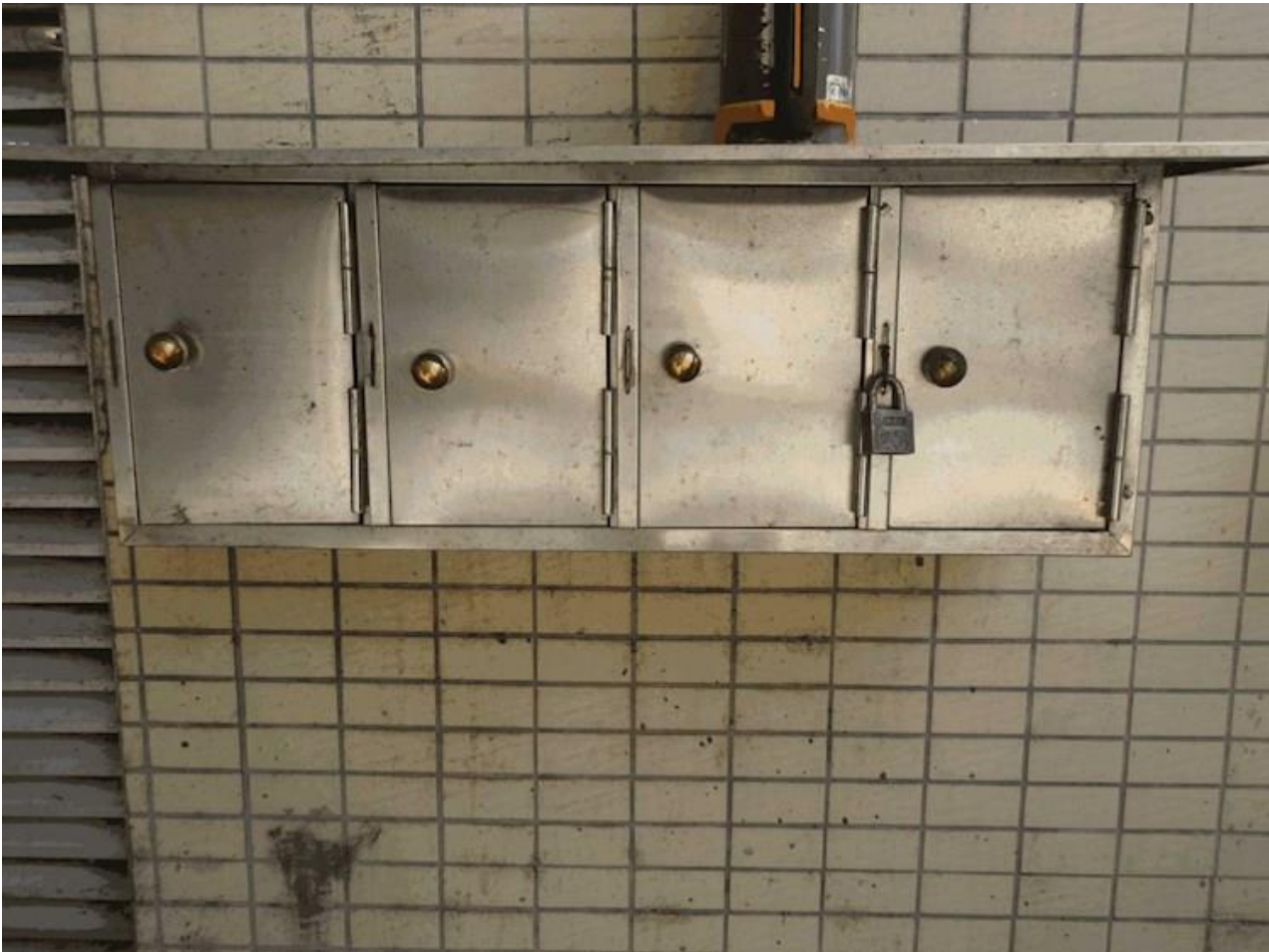
Procedural Security - Question # 67