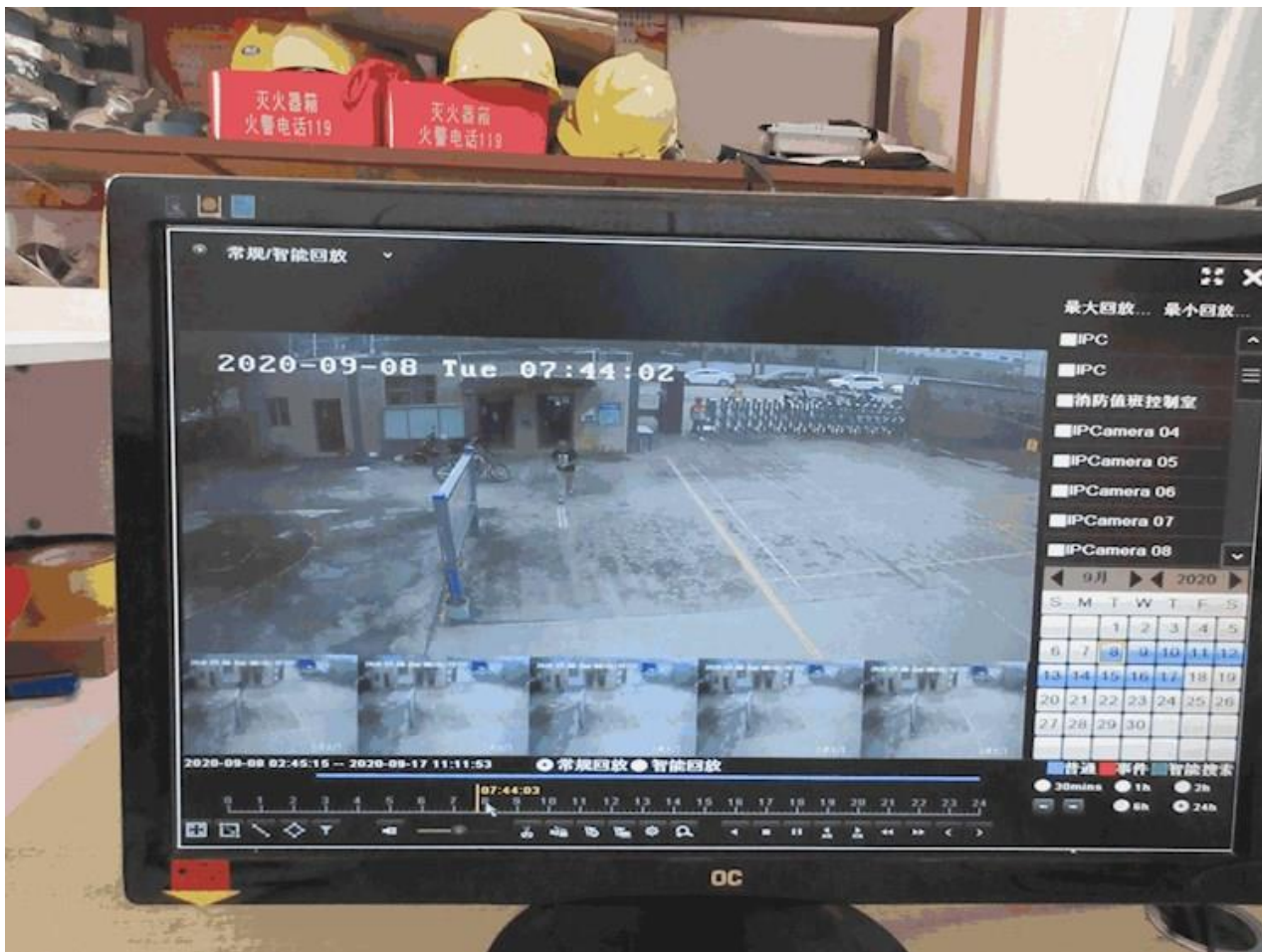
Physical Security - Question # 103